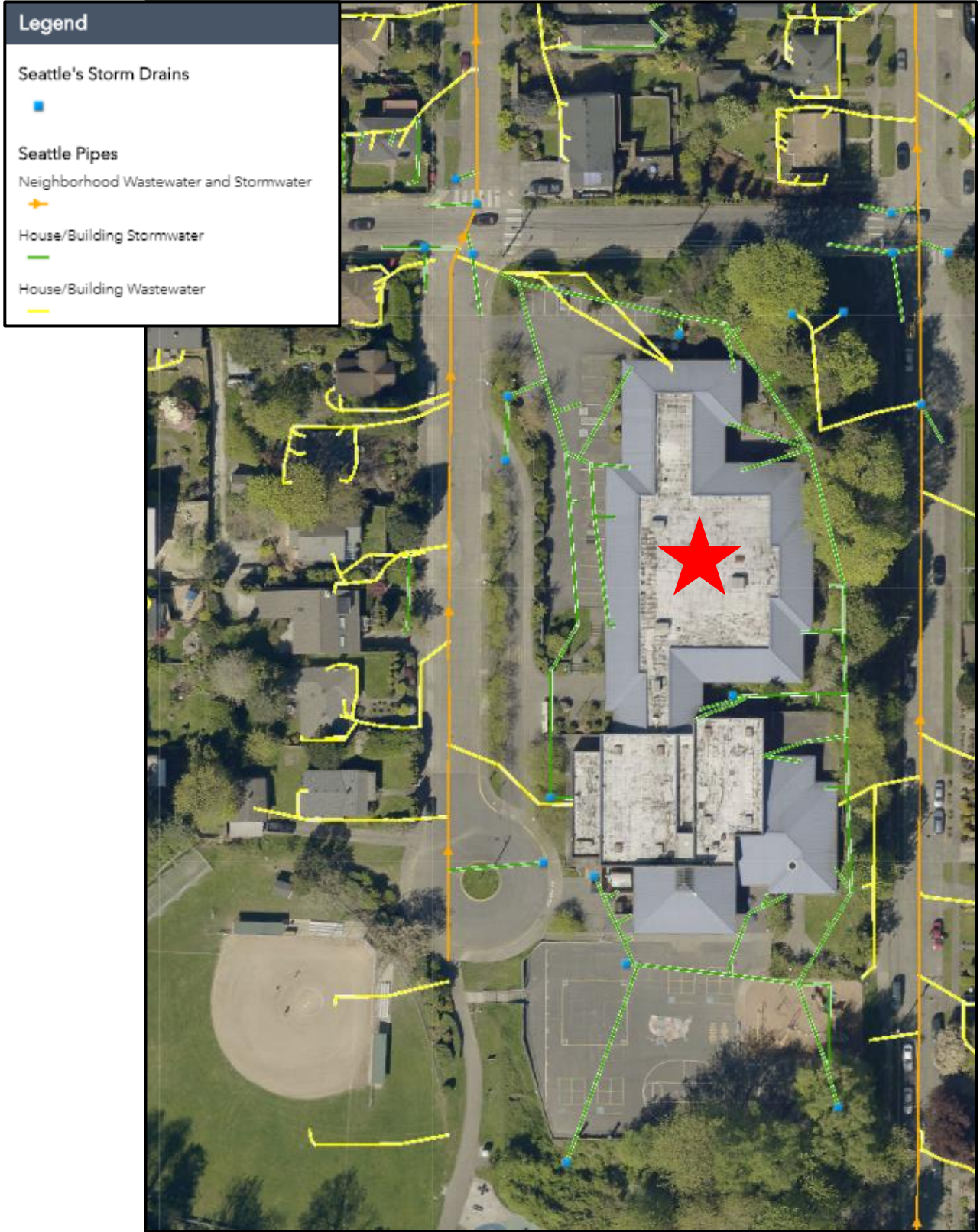
Lesson 5: Stormwater Pipes ★ Lawton Elementary School